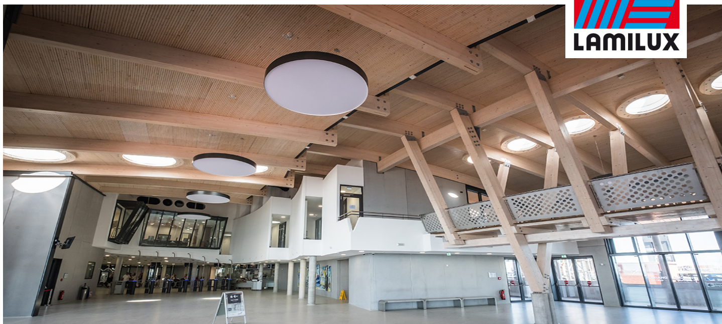
Harbour Terminal "Hafendüne", Norderney (Germany)